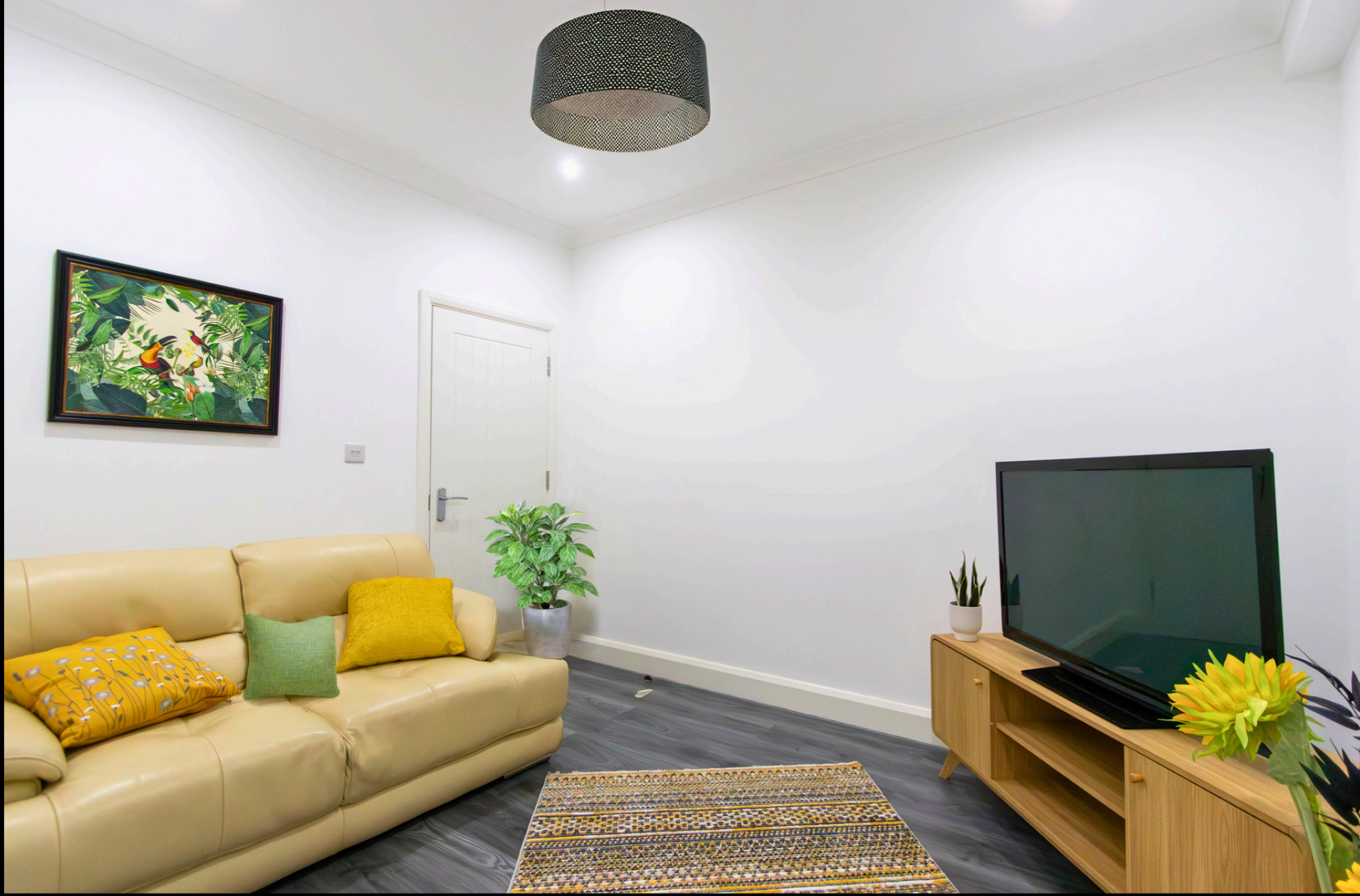
LIVING ROOM 2